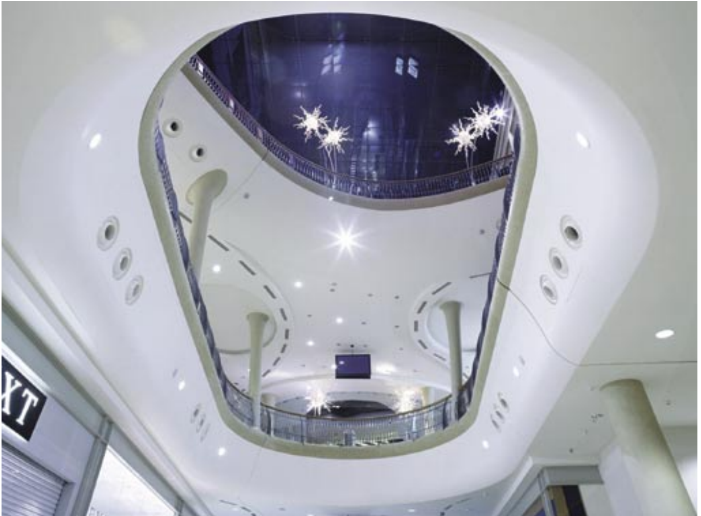
Winner of 2003 Plaisterers Trophy Project: Bullring, Birmingham Contractor: Stevensons of Norwich