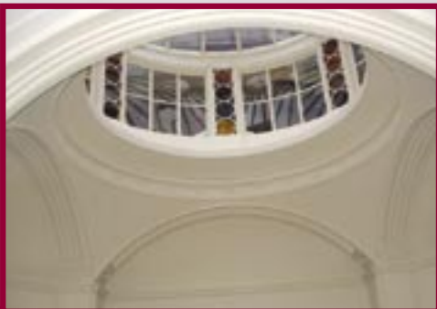
Plasterers Trophy 2004 entry Project: Tribune, Tyringham Hall Contractor: Revival Decorative Mouldings