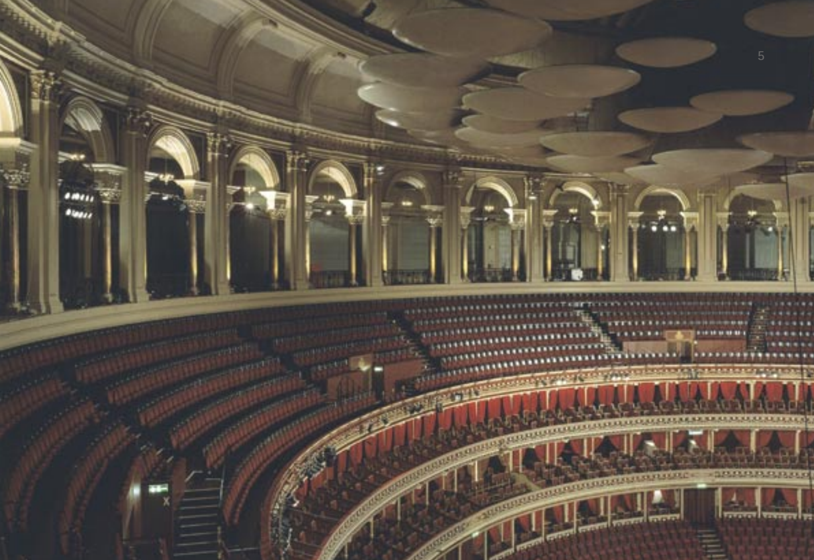
Above: Royal Albert Hall, London Contractor: BWDL